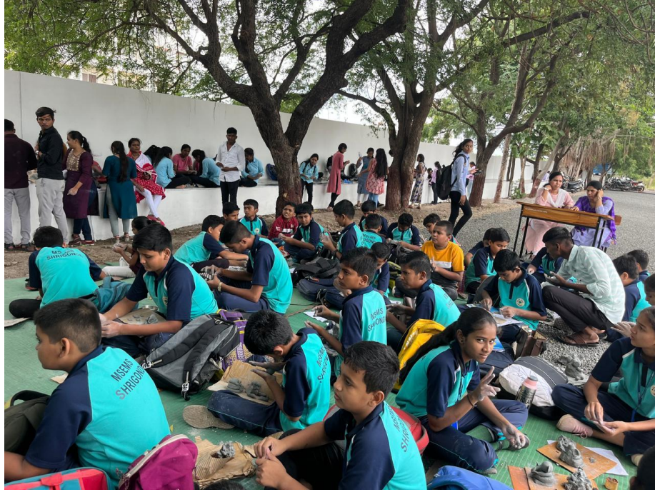
Participation of high school students from Shrigonda taluka at Maharaja Jivajirao Shinde, College, Shrigonda