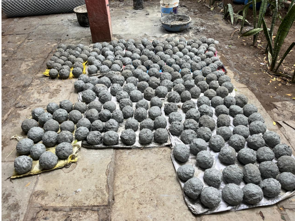
Raw material used in the preparation of Ganesh Idol