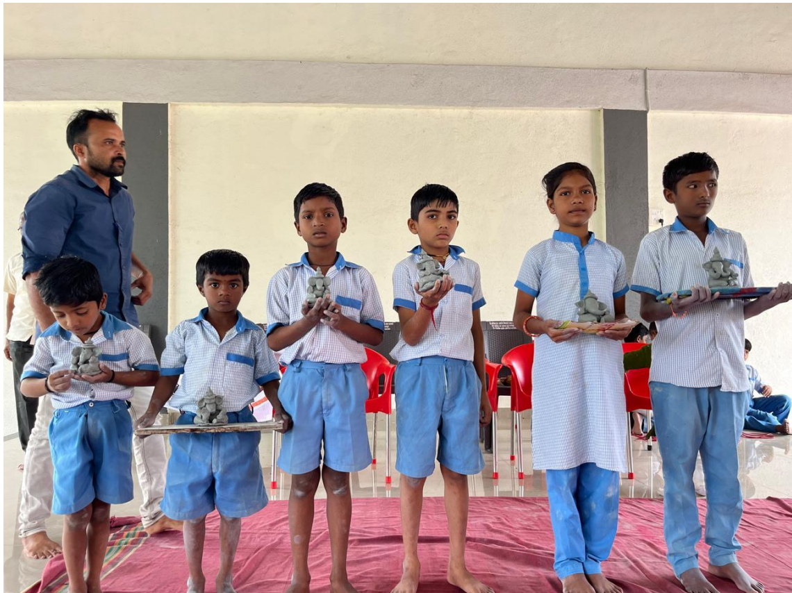
Participation of students