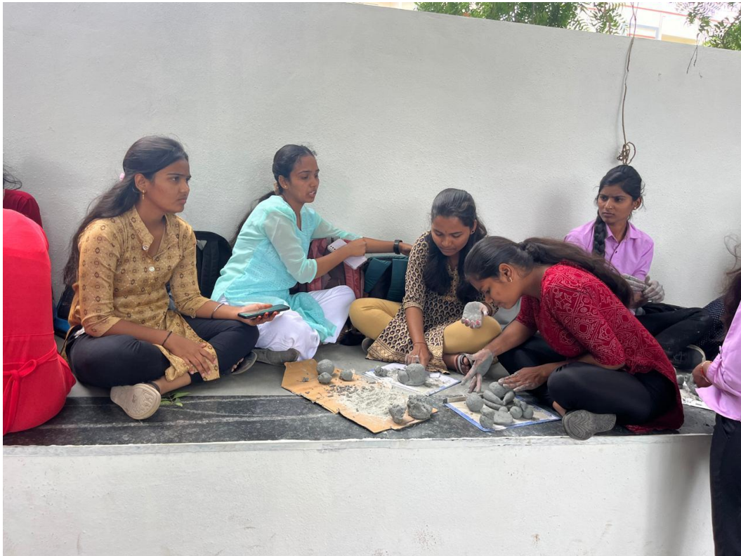
Participation of high school students from Shrigonda taluka at Maharaja Jivajirao Shinde, College, Shrigonda