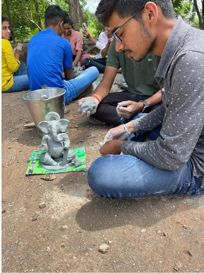
Workshop at Shri Anand College Pathardi