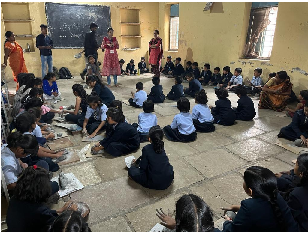
Workshop at Gurukul English medium School, Pathardi