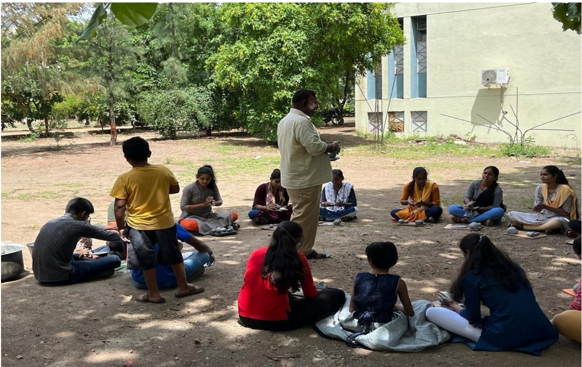
Workshop at Shri Anand College Pathardi