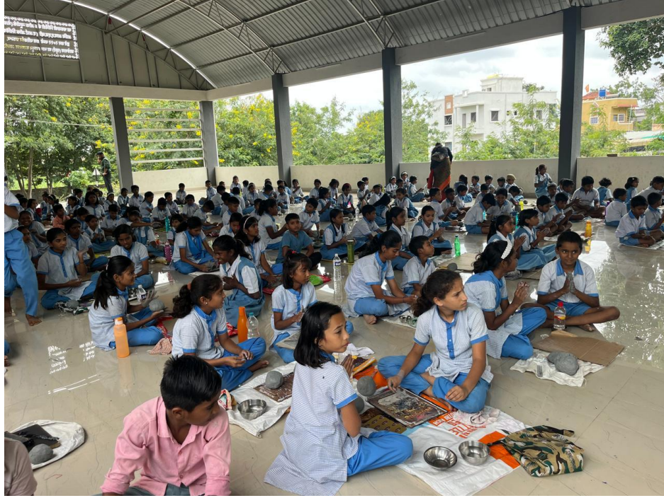
Participation of primary School students