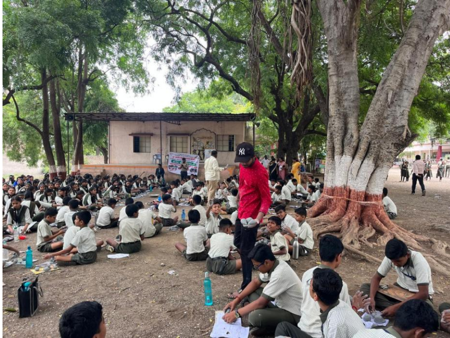
Students engaged in the preparation of Ganesh Idol