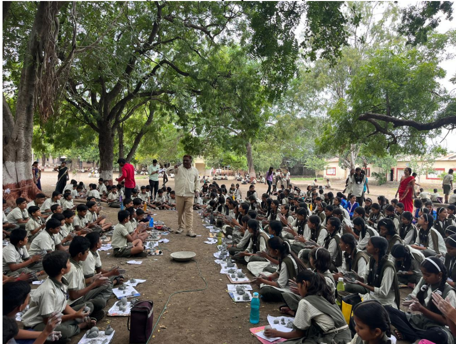
Students engaged in the preparation of Ganesh Idol