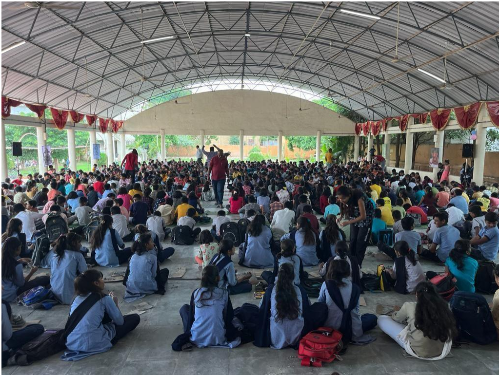
A Ganesh idol workshop was held at Rajale Mangal Karyalaya at Adinathnagar for primary and high school students.