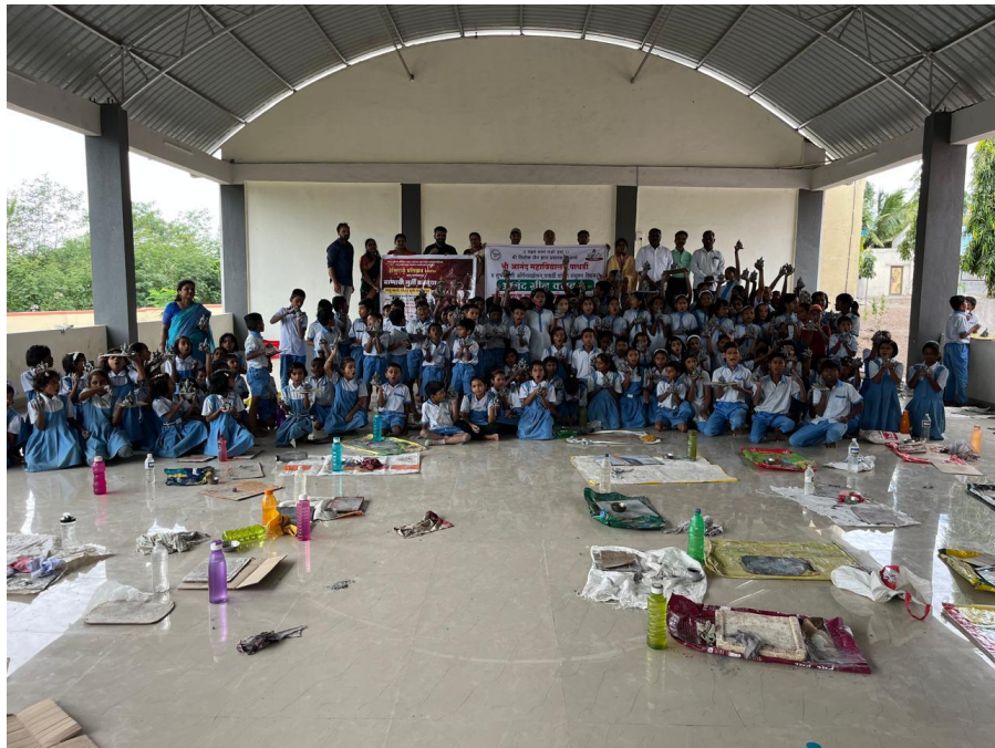
Prize distribution in Ganesh Idol making competition