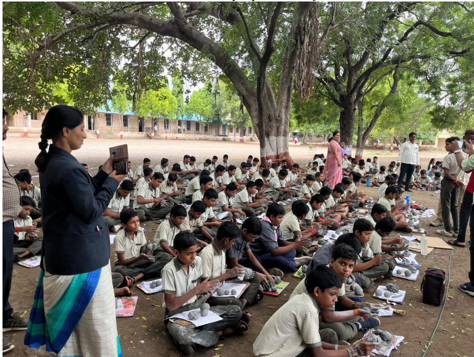
Students engaged in the preparation of Ganesh Idol