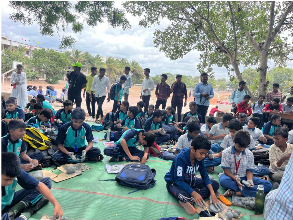
Participation of high school students from Shrigonda taluka at Maharaja Jivajirao Shinde, College, Shrigonda