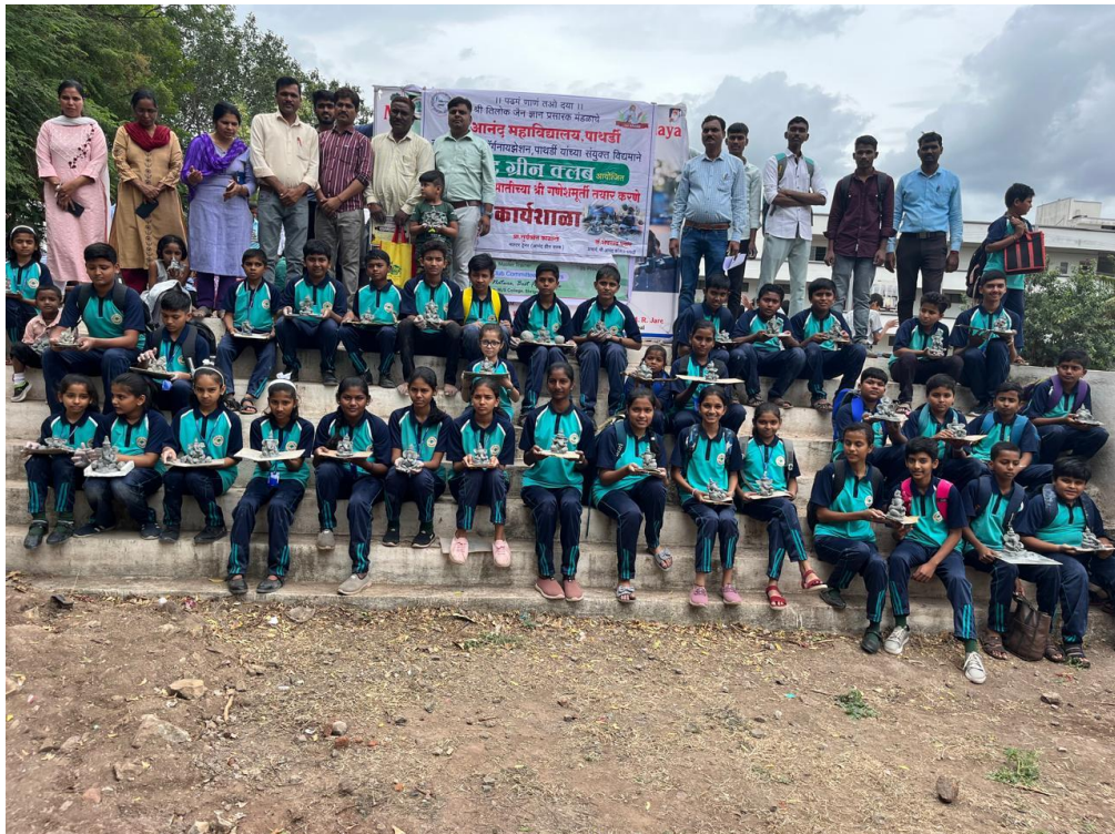
Shri Anand College green club workshop at Shrigonda