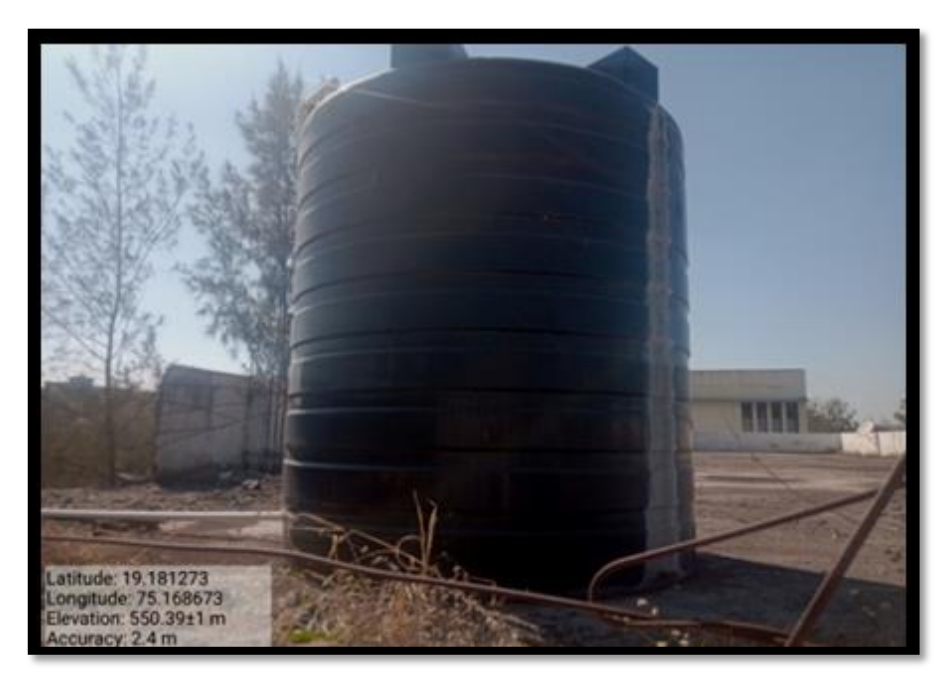
Water storage tank and water distribution pipe system