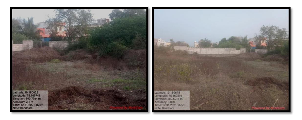
Seasonal water bund constructed at college campus for percolation of water