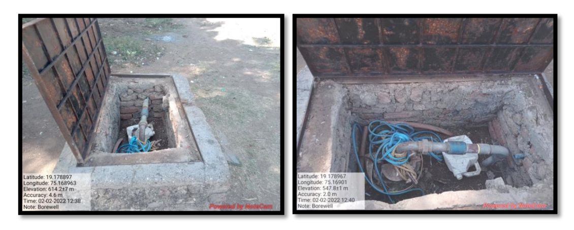
Bore-well located at college campus