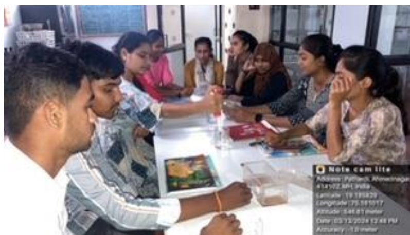
Preparation of Surface sterilization agents