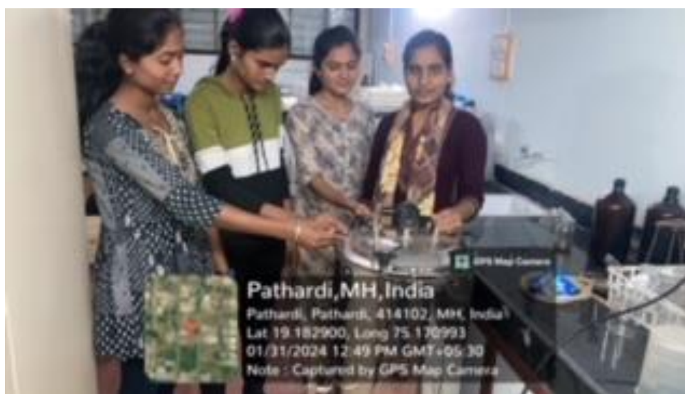
Sterilization of media and glassware