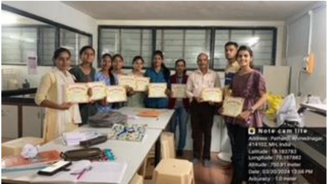
2023-24, Batch of certificate course in plant tissue culture technology