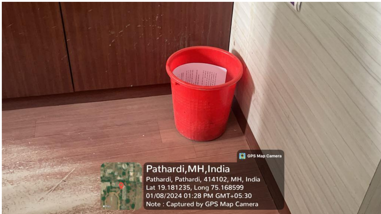
Dustbin placed at various places for the collection garbage at college premises.