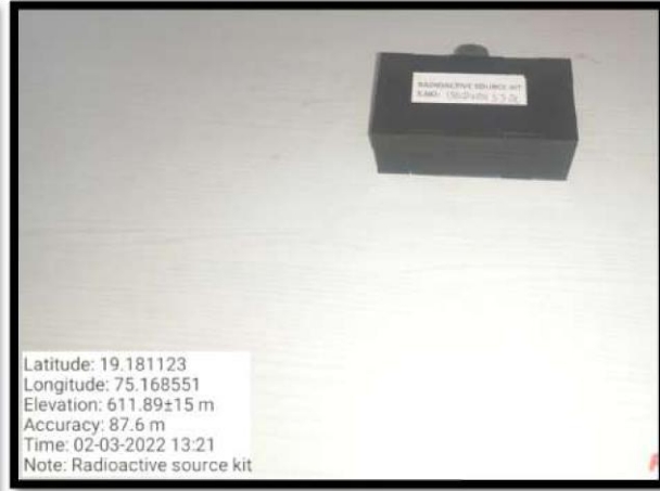
Kit for storing radioactive source