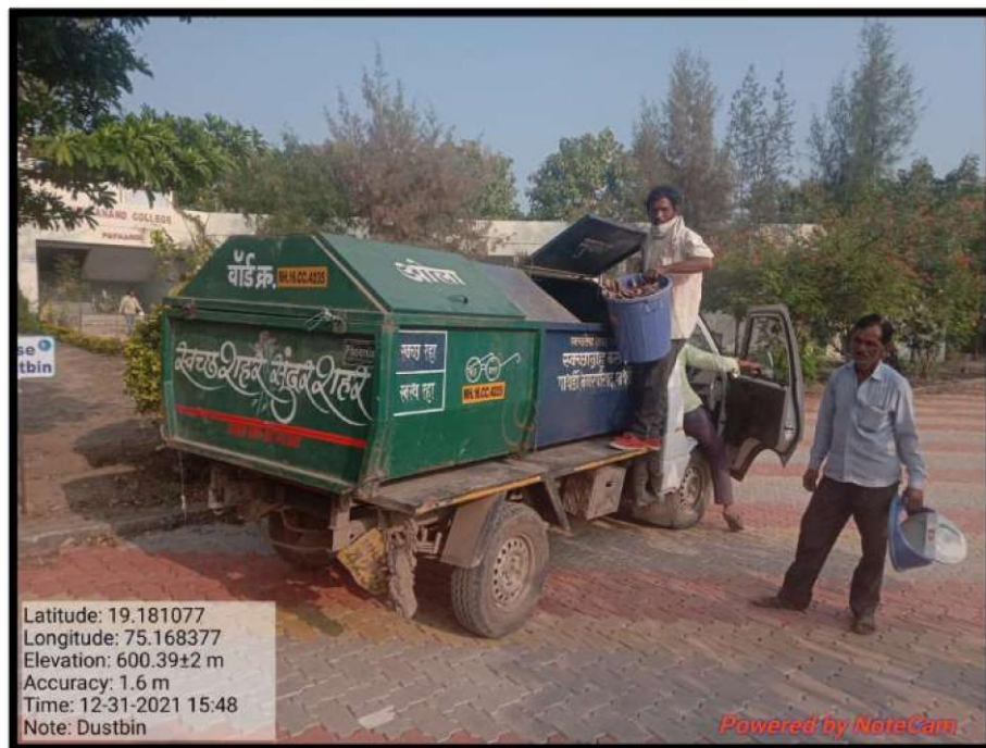
Collection of garbage by Pathardi Muncipal Corporation Vehicle