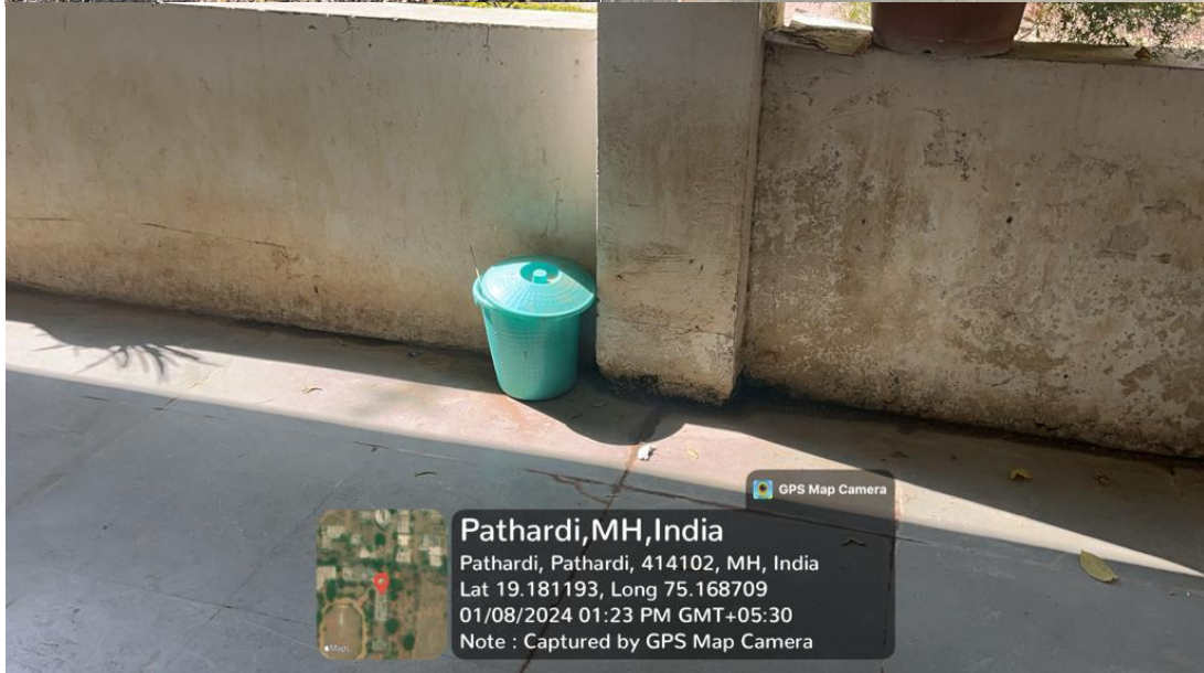
Dustbin placed at various places for the collection garbage at college premises.